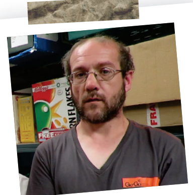
Martin went without food due to problems in the benefits system